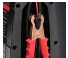
Easy Cable Storage Wrap around cable design