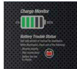
Digital LED Charge Monitor includes battery trouble status indicator