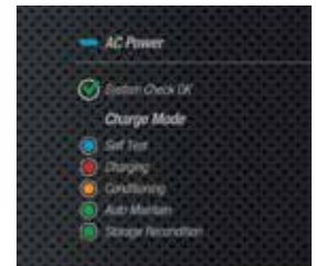
Charge Mode Status Indicator identifies each stage of charging