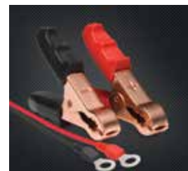
DC Charging Clamps and Quick connect ring terminals - 6 Amp model only